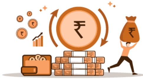
Fig 1: Return on Investment